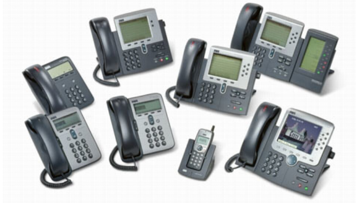
Some Cisco IP Phones (for CCNA Voice 640-460)